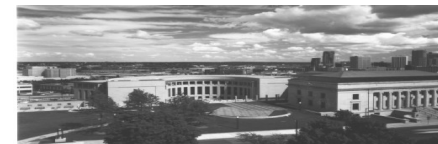
Minnesota Judicial Center, St. Paul